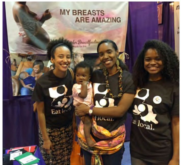
City of New Orleans Health Department

With around 50,000 visits per year in our free WIC clinics, we began to look at WIC as a nexus for family violence prevention. We also saw this as an opportunity to have a population-wide impact due to the large number of New Orleans children that are income-eligible for WIC. We began by instituting intimate partner violence screenings as a standard practice at all of our WIC clinics to serve as a starting place for dialogues with clients around healthy and safe relationships. Adult clients who are at risk for intimate partner violence are then referred to the New Orleans Family Justice Center for further services. In order to move more upstream, we are also collaborating with the Children's Bureau of New Orleans and the Tulane University School of Public Health and Tropical Medicine to pilot two positive parenting interventions in our WIC clinics, including Positive Parenting Program (Triple P) and Play Nicely. These interventions are both brief, one-time interventions designed to prevent child maltreatment by teaching parents skills to build strong, healthy relationships with their children. Triple P is a family support system designed to develop positive family relationships and prevent and improve behavioral and emotional problems in children and teenagers. Play Nicely is a computer-based intervention for parents to learn supportive parenting strategies. While both programs have been shown to reduce child